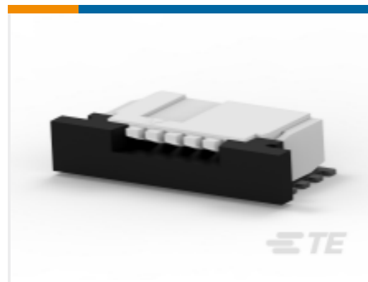
TE Part # 84953-4 1MM FPC HORZ.TOP CONT.ASSY 4P