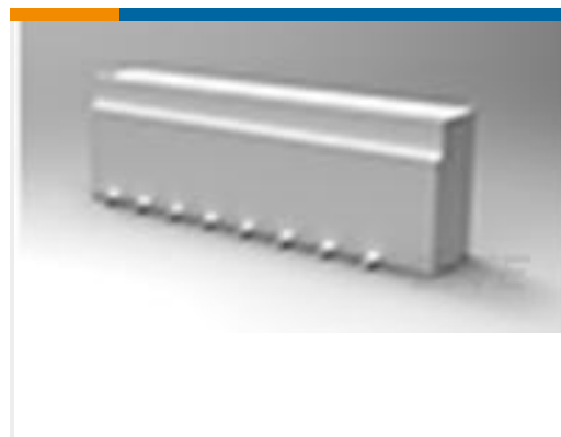
TE Part # 1735042-4 1MM FFC SMT V ASSY 4P EMBOSS