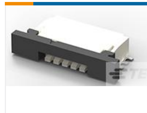
TE Part # 1735265-4 1MM FPC HORZ.BOTTOM CONT.ASSY 4P (Au)